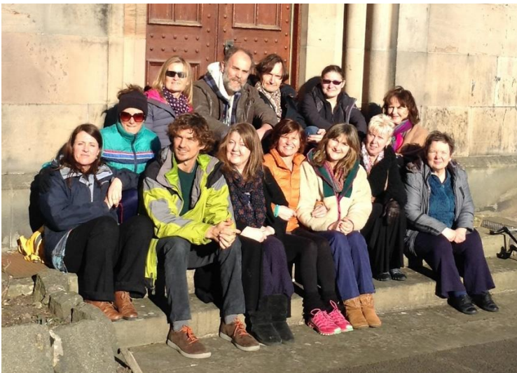
Module 1 Workshop

Trainees that attend regular shaking groups will find it easier to complete their training. There are many groups online. In Scotland there are regular groups. All details are available on www.trescotland.com . More Scottish workshops and groups will be organised so keep checking and add your name to the newsletter/ mailing list. Our calendar is at www.meetup.com/tregroup